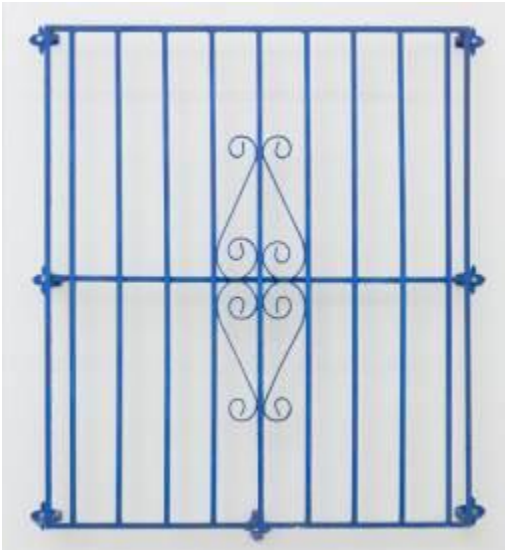
Tom Scicluna 50" x 46" x 6" , 2018 Iron security grill and lag screws 50 x 46 x 6 inches