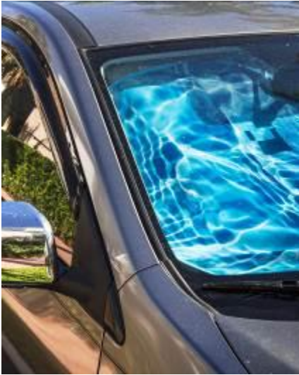
Anastasia Samoylova Car Shade, (FloodZone Series) , 2018 Dye-sublimation print on metal 40 x 32 inches Edition 1 / 5 Hidden metal frame in the back for hanging