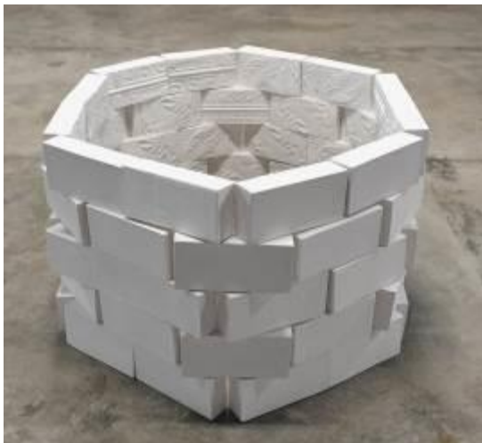
Liene Bosque Zancope Muller Stockade, 2015 Hydrocal 20 x 53 x 53 inches With artist-designed base (not seen here)