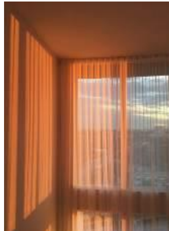
Monica Sorelle (Monica C Barberousse) Miami Hues (Yellow Ball) , 2016 Archival inkjet print 11 x 14 inches Edition of 5 + 2 A.P.