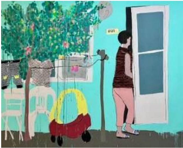
Hermes D Berrio NEVER TOO LATE TO GO BACK TO BED, 2021 From Series The Extravagance of the Quotidian Mixed media on canvas 80 X 96 inches