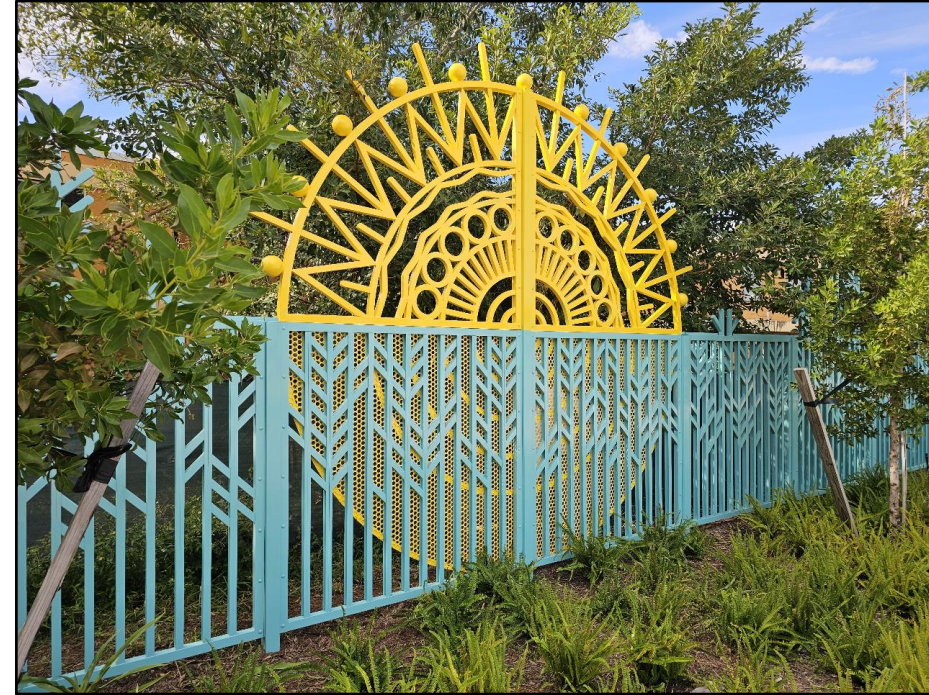
Felice Grodin, GIANT GREEN ANEMONE , 2025 Douglas Road Metrorail Station Amlmatd, Eden by the Pool , 2025 Culmer Place, 600 NW 10th Street, Miami FL 33136