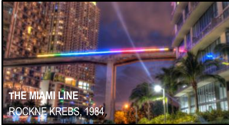
THE MIAMI LINE ROCKNE KREBS, 1984