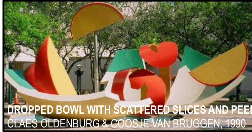
DROPPED BOWL WITH SCATTERED SLICES AND PEEL CLAES OLDENBURG & COOSJE VAN BRUGGEN, 1990