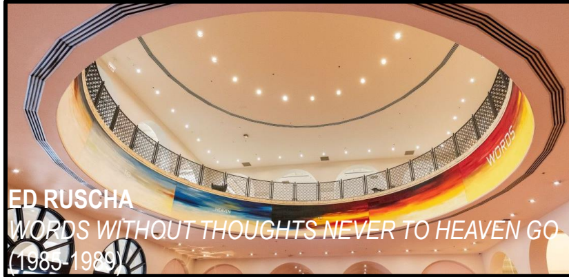
ED RUSCHA WORDS WITHOUT THOUGHTS NEVER TO HEAVEN GO (1985-1989)