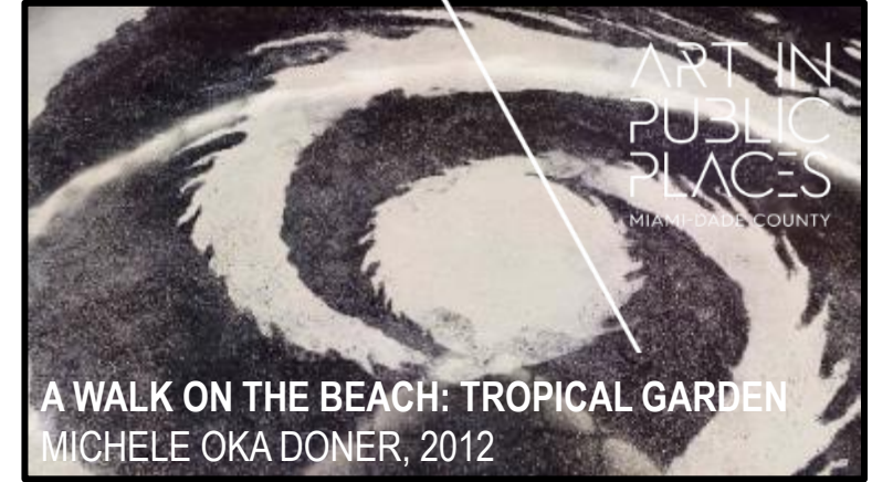
A WALK ON THE BEACH: TROPICAL GARDEN MICHELE OKA DONER, 2012