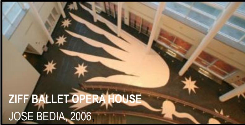
ZIFF BALLET OPERA HOUSE JOSE BEDIA, 2006