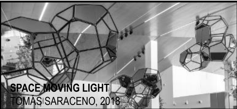
SPACE MOVING LIGHT TOMÁS SARACENO, 2018