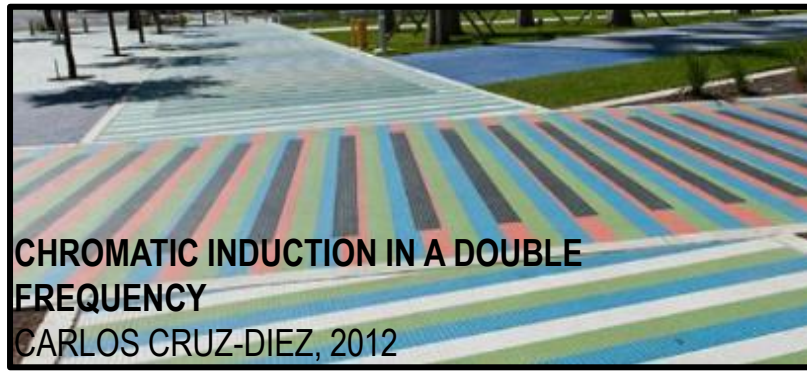
CHROMATIC INDUCTION IN A DOUBLE FREQUENCY CARLOS CRUZ-DIEZ, 2012