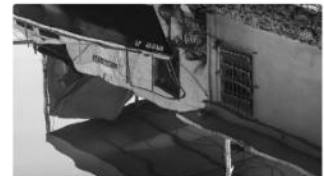
Anastasia Samoylova Boat Reflection in the Seybold Canal 2021