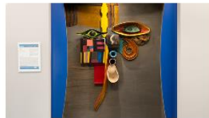
Pepe Mar The Traveling Eye 2021