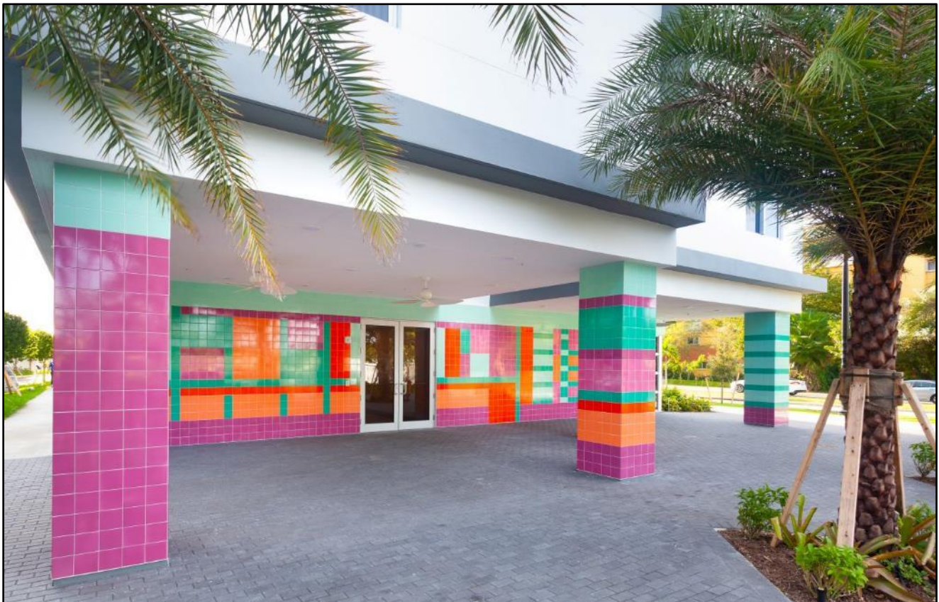
Karen Rifas, Welcome to the Village , 2019 Caribbean Village Public Housing facility