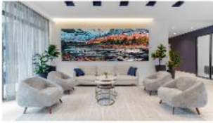
Emilio Perez Lemon River 2024