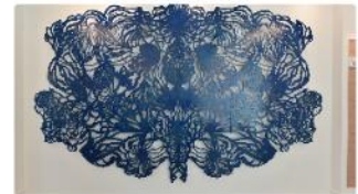
Marielle Plaisir Abysses 2021