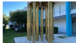
Felice Grodin Árbol Cósmico / Cosmic Tree 2019