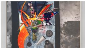
Pepe Mar The Machine (Garden by the Sea Series) 2021