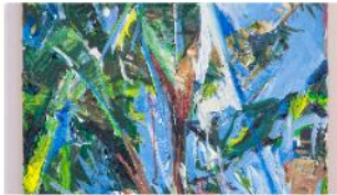
Magnus Sodamin Caribbean Mountains No. 3 2019