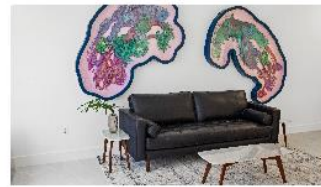
Jennifer Clay We Grew When You Weren't Looking 2022