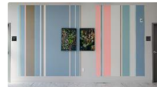
Adler Guerrier Wall Paintings (Diurnal Heptad plus SW7028) and six photographs-- deploy as an occurrence of tones and elements from the nearby commons, compel these articulated points of relation into form--a community room 2021