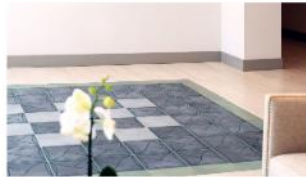
Deon Rubi Deco Tile 2019