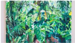
Magnus Sodamin Caribbean Mountains No. 2 2019