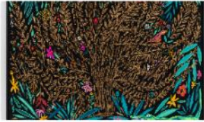
Summer Wheat Tree Bouquet 2024