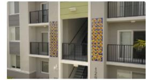
Xavier Cortada Native Flora 2021