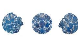
Marielle Plaisir Abysses Triptych 2021