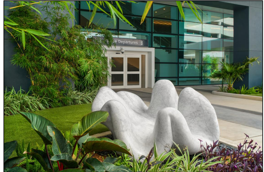
Claudia Comte, Three Big Marble Corals (Rose) , 2021, Terminal B PortMiami.